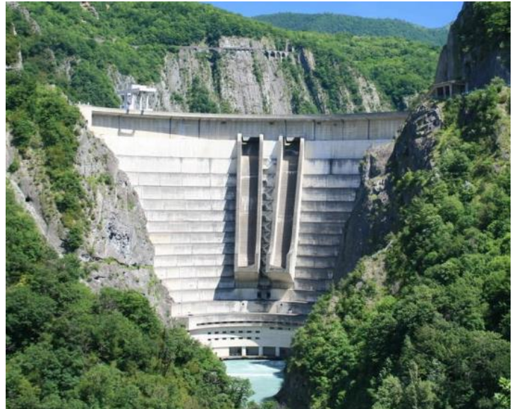
The Monteynard dam, located on the Drac river (France), is 135 meters high and 230 meters width. Its hold 275 million m 3 of water.