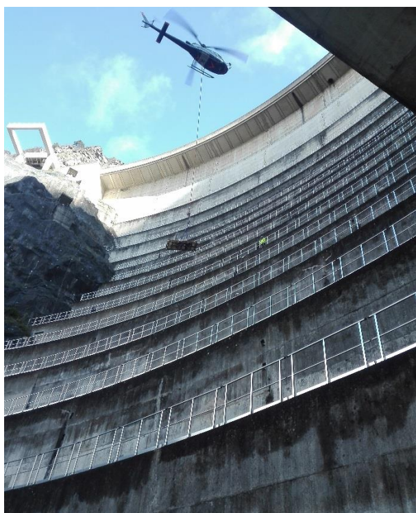
The guardrails were delivered to the different dam stands by helicopter.