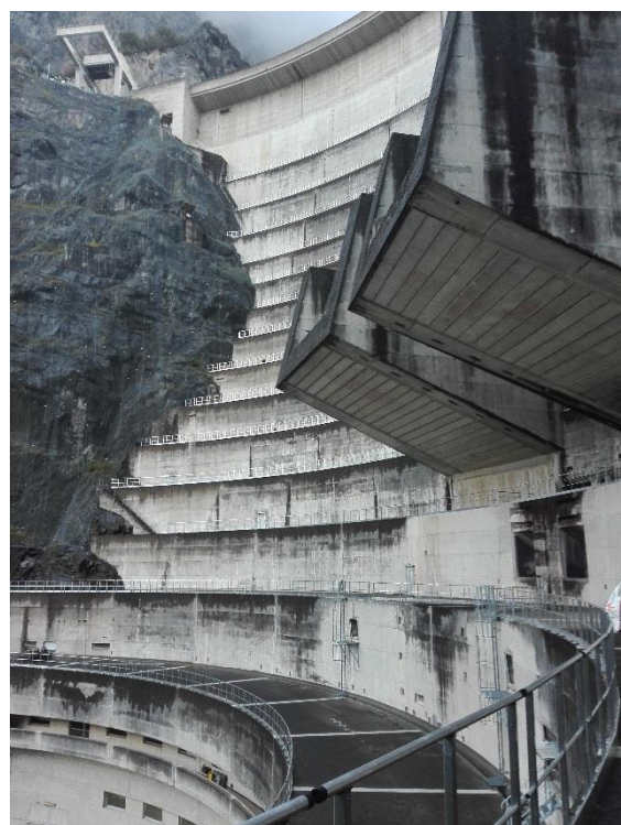
2 meters elements specialy design to fit rounded stands