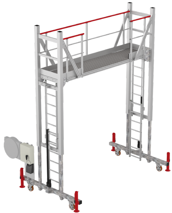
3D view platform