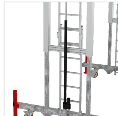
Ladders adjustable in height by electric jack from 2000 to 3200 mm