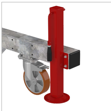
4 swivel wheels with brakes and 4 immobilization cranks