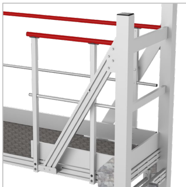
Guardrails on all length on front vehicle side and guardrails with opening on the rear vehicle side