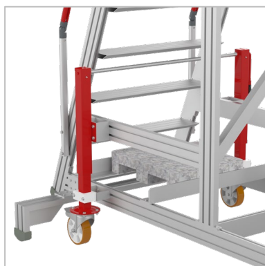
Height-adjustable front feet and wheels