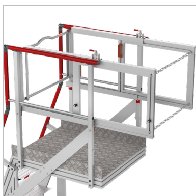
Guardrails adjustable in length