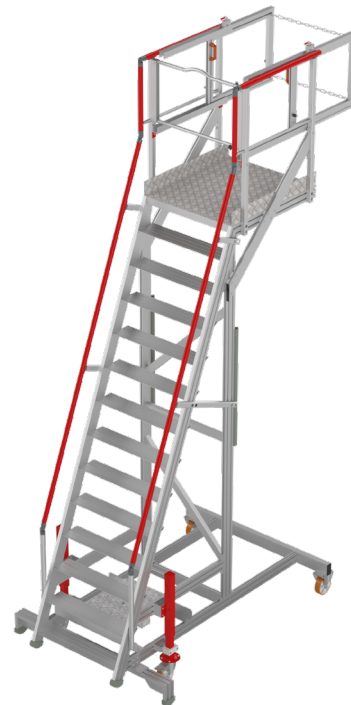
3D front view of the stepladder