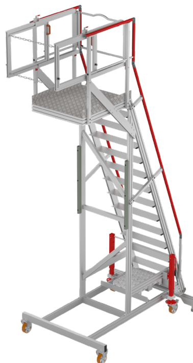
3D rear view of the stepladder